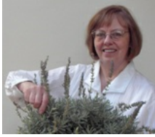
by Betty Sanders, Leaflet Contributor

Don't be seduced by the beautiful displays at garden centers. It's too cold to plant any annuals except pansies, peas, spinach and onions. Most plants such as marigolds and impatiens need soil temperatures in the 60s or higher to survive. And favorite vegetables like tomatoes and cucumbers need the soil to be over 70° before you think of planting them outside. Spend a few minutes online getting information from reliable sources, not from the guy at the box store who may have been in charge of light bulbs last week. You'll save yourself time, money, and effort.