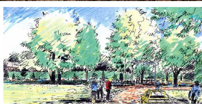
A new entrance and easily accessible parking improves visitors' entry into the gardens.