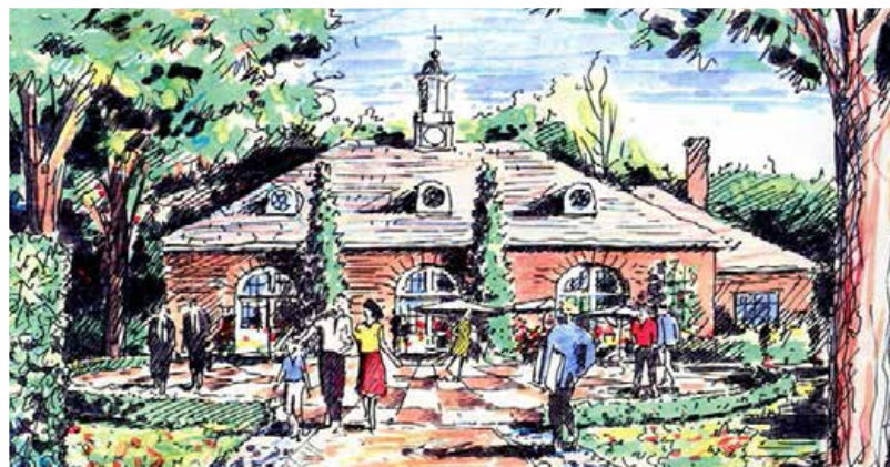
Flower shows and exhibits engage people in their passion for plants and design.