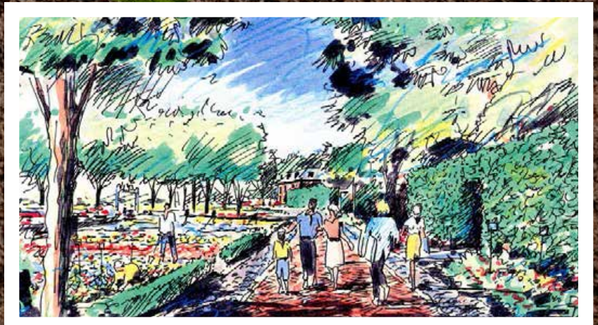
Gardens delight and refresh visitors by connecting them to landscape design and historic gardens. We hope to restore the historic Olmsted Asian garden.